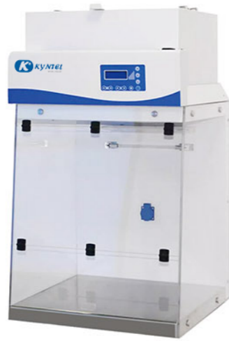
BBS-V600 & BYKG-VIII