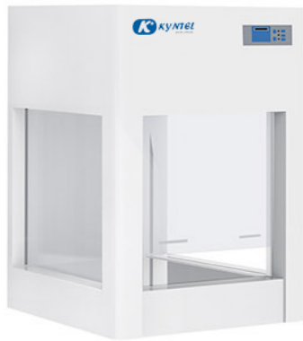
BBS-V500 & BYKG-VII