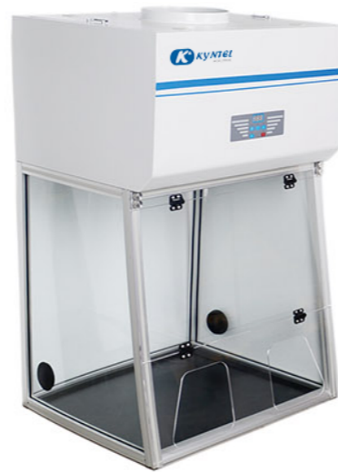
BBS-V700 & BYKG-IX BYKG-X & BYKG-XII